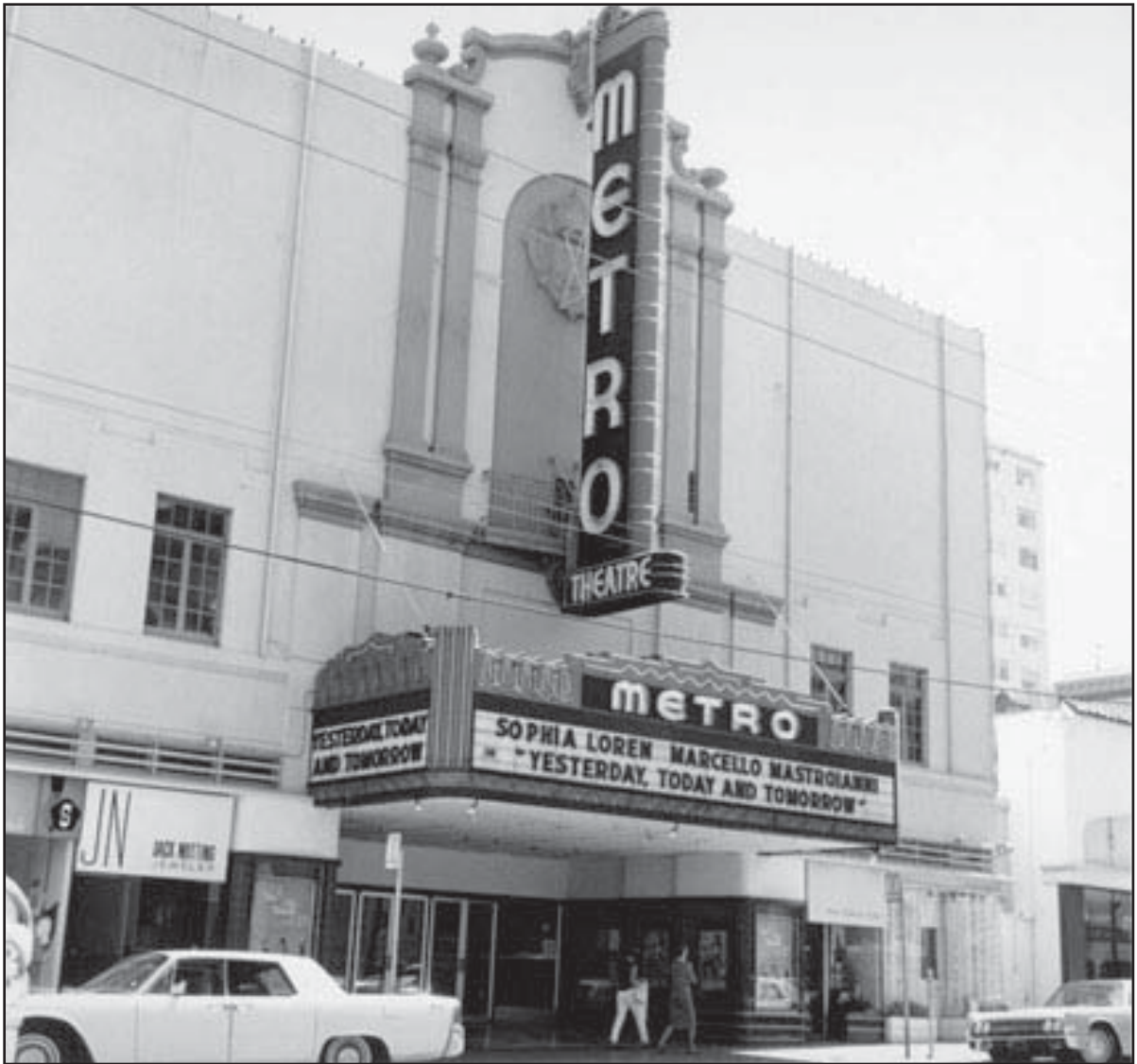
View of Metro Theatre, 1964. (Source: San Francisco Public Library History Room, Photograph Collection, #AAA-8923).