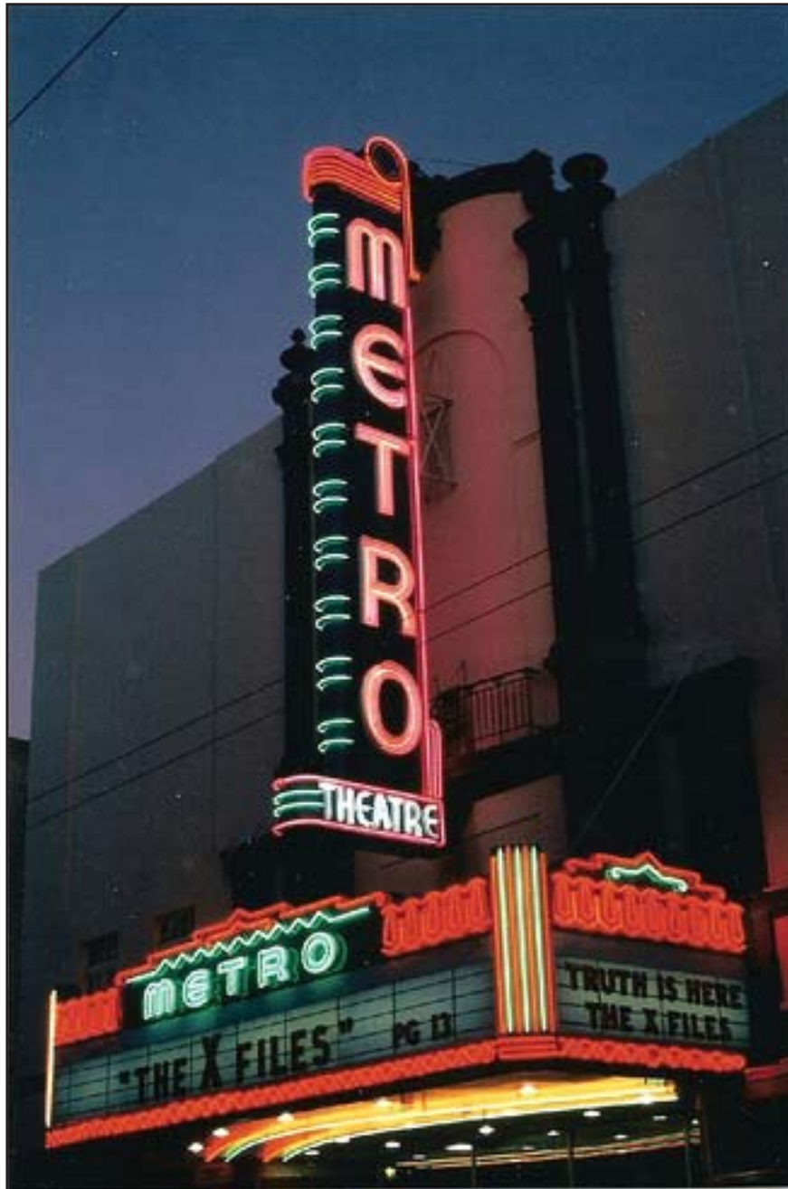
Exterior view of Metro Theatre at night prior to 1998 renovation.