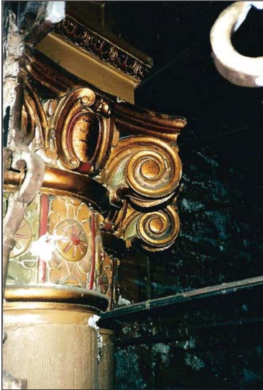
Detail view of capital in auditorium prior to 1998 renovation.