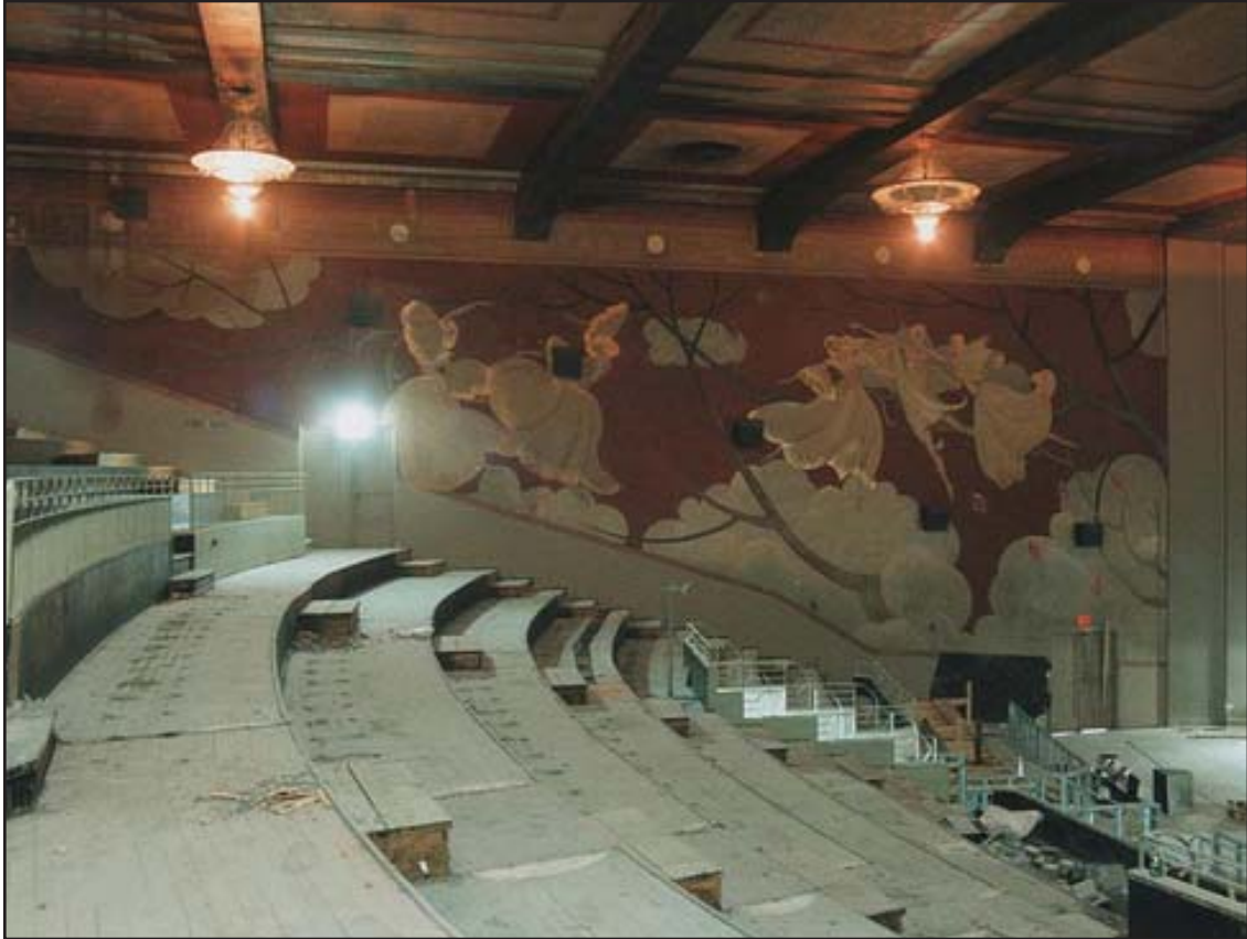
Interior view of auditorium and murals undergoing renovation in 1997.