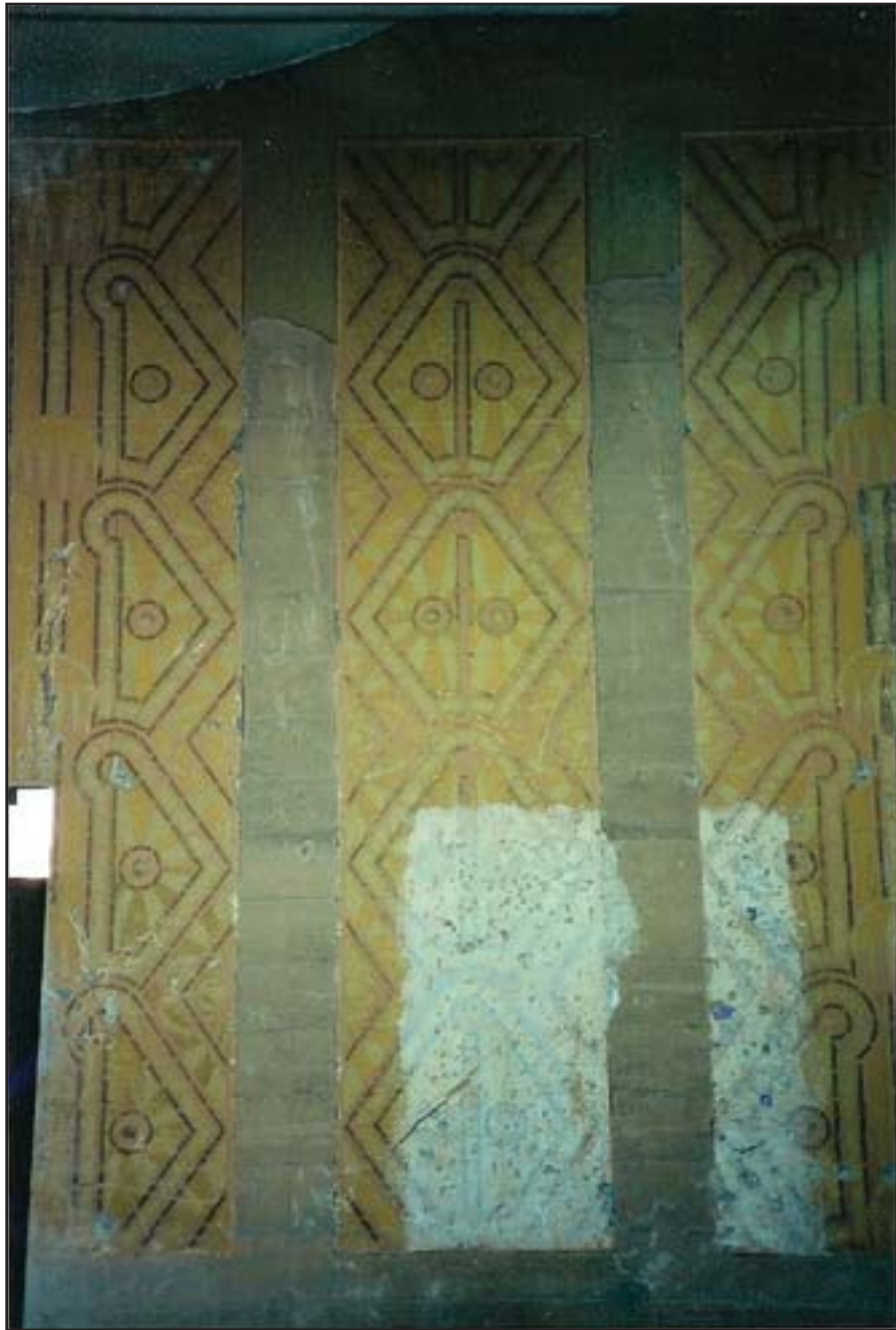
Detail view of finishes at lobby wall prior to 1998 renovation.