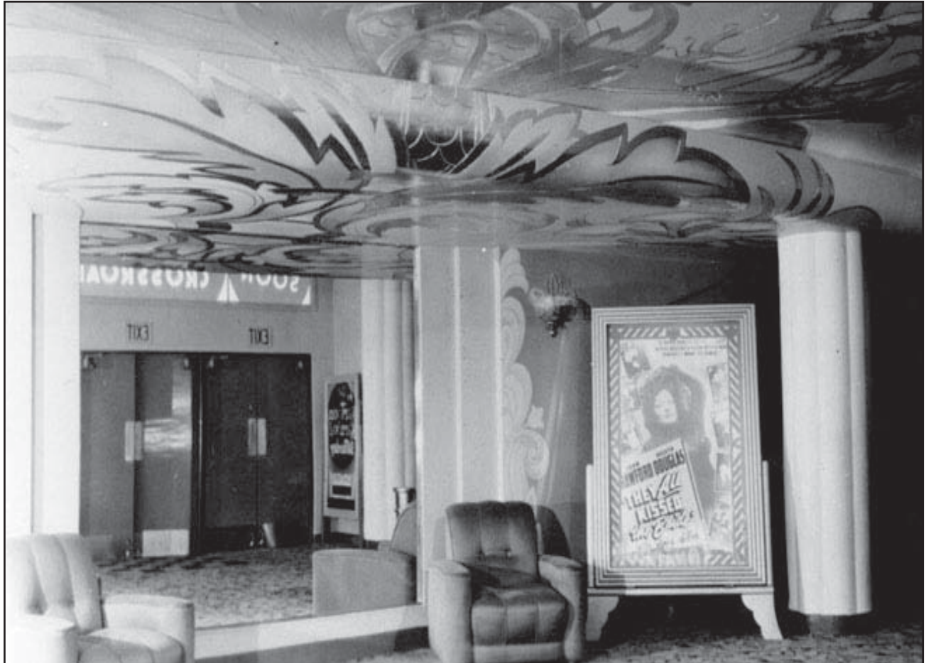
View of Metro Theatre, 1942. (Source: San Francisco Public Library History Room, Photograph Collection, #AAA-8927).