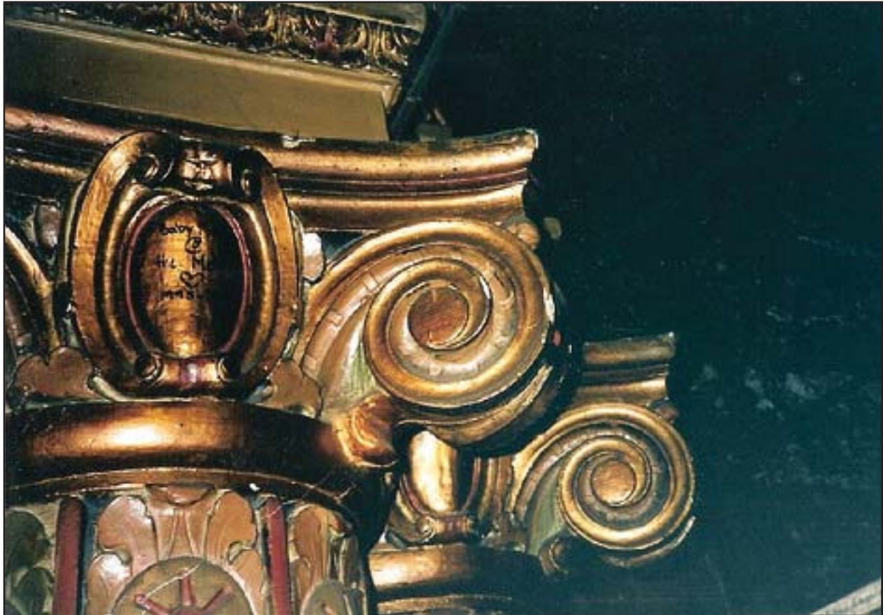
Detail view of capital in auditorium prior to 1998 renovation.