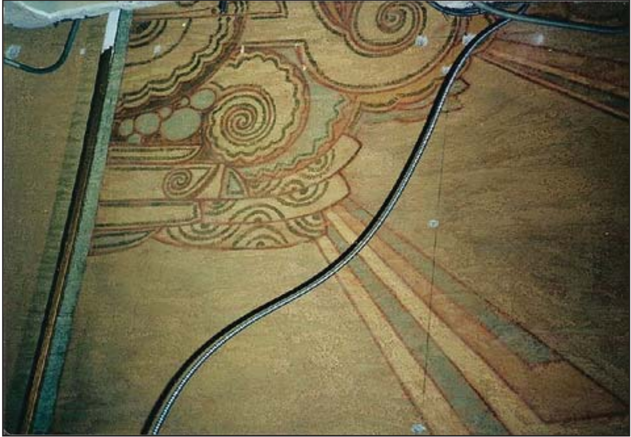
Detail view of finishes at ceiling of lobby prior to 1998 renovation.