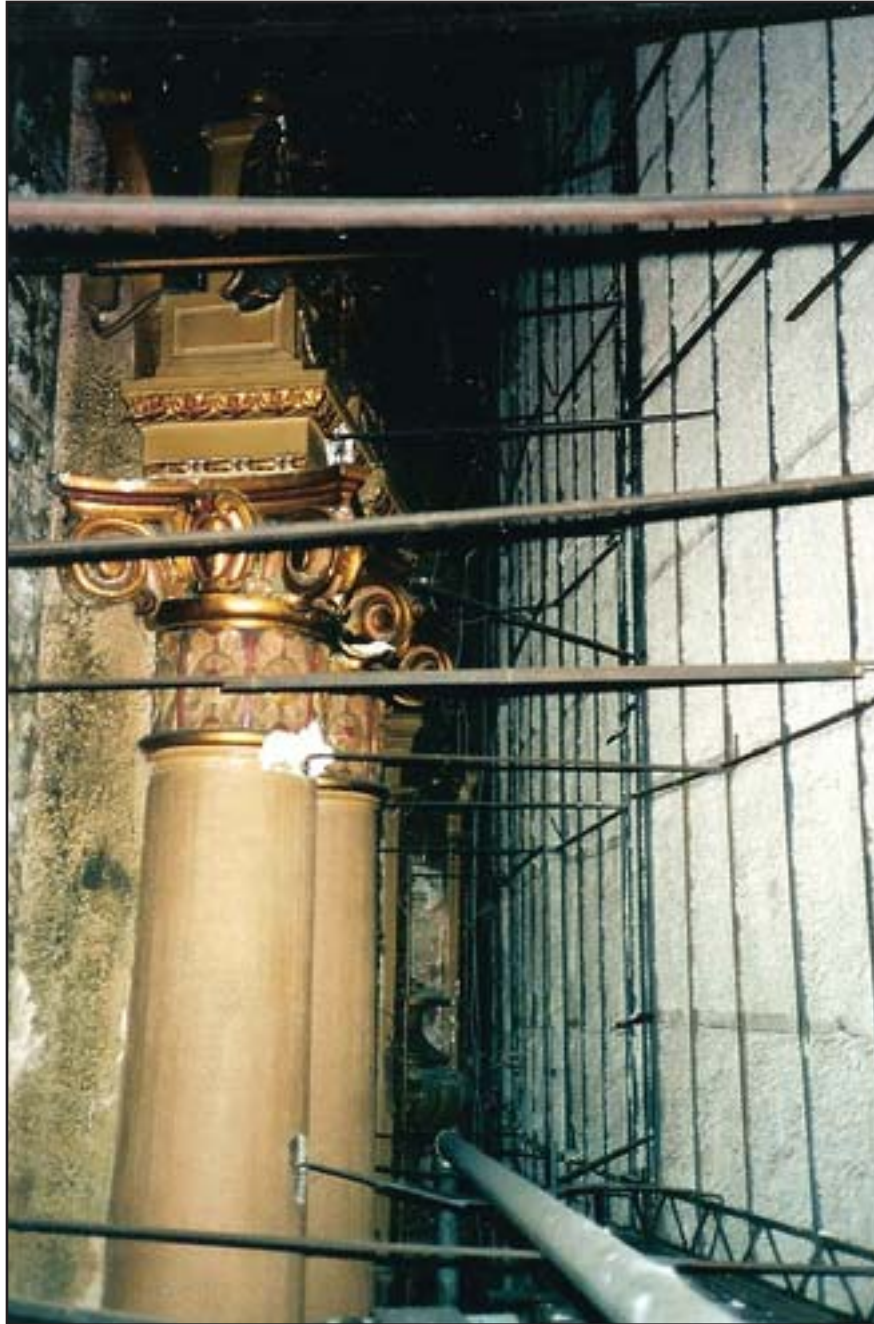
View of original 1924 Ionic columns in auditorium behind 1941 renovations prior to 1998 renovation.