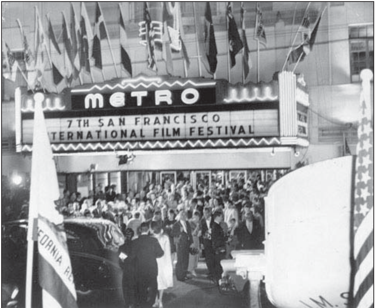
View of Metro Theatre on opening night of the 7th San Francisco International Film Festival, 31 October 1963. (Source: San Francisco Public Library History Room, Photograph Collection, #AAA-8922).