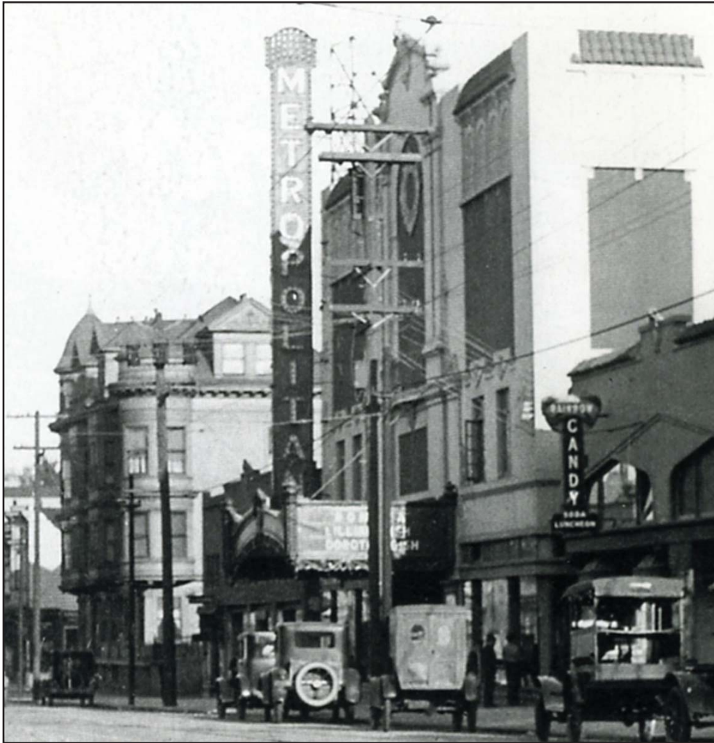
View of Metro Theatre; note original name “Metropolitan” spelled out on marquee. (Source: Jack Tillmany, Theatres of San Francisco , Charleston, Arcadia Publishing, 2005, 97).