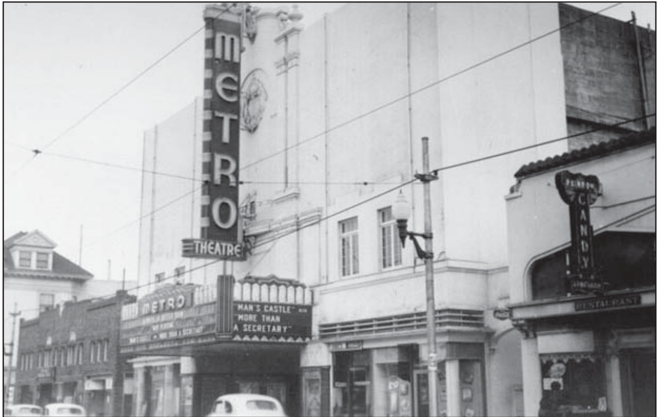
View of Metro Theatre. (Source: San Francisco Public Library History Room, Photograph Collection, #AAA-8924).