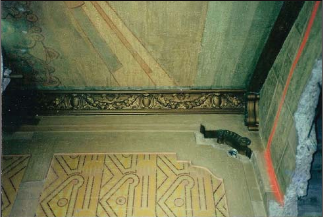
Detail of finishes at ceiling and wall of lobby prior to 1998 renovation.