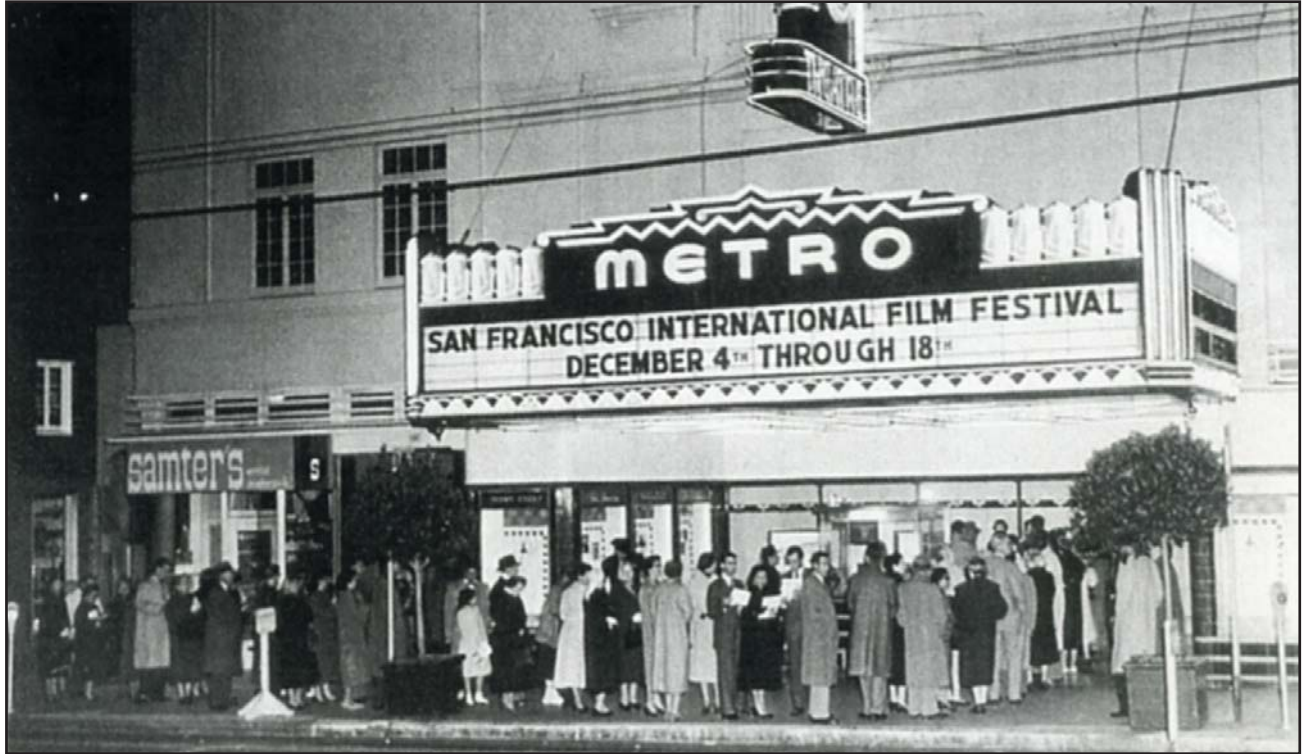
View of Metro Theatre at opening night of the first San Francisco International Film Festival, then one of San Francisco's leading first-run venues .