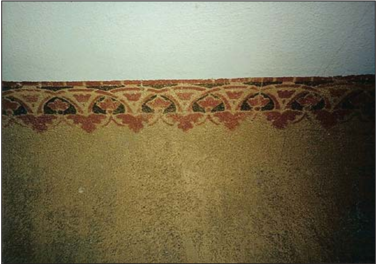
Detail view of finishes at ceiling of mezzanine prior to 1998 renovation.